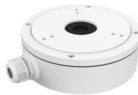
LTB307 Junction box