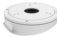
LTB309 Inclined ceiling mount